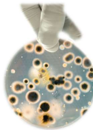
Coils with Mold